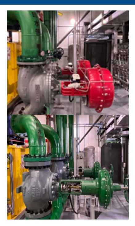
The Fisher easy-e valves installed within the closed-loop cooling water flow control for generator lubricating oil

Incomplete process parameters and deviation between the flow parameters set by equipment manufacturers and actual flow conditions created a considerable hurdle. The absence of flow meters exacerbated the situation, complicating the selection of appropriate valves for the system.