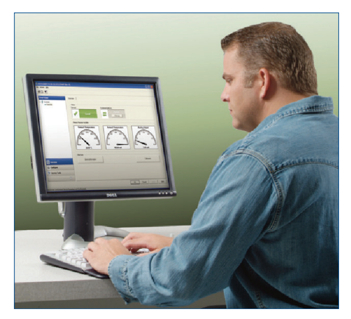
Use the Calibration Excellence solution from Emerson and Beamex to simplify calibration activities and ensure regulatory compliance.