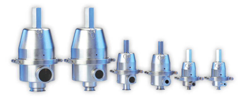
SIX PORT SIZES AVAILABLE

With the most complete line of regulators in the industry, Emerson's worldwide distribution network includes an experienced sales and support team consisting of more than 2,000 technical experts available to serve you from nearly 200 offices throughout the world. No other supplier can equal Emerson's product integrity, reliability, safety and performance. Call your local Sales Office for additional information.