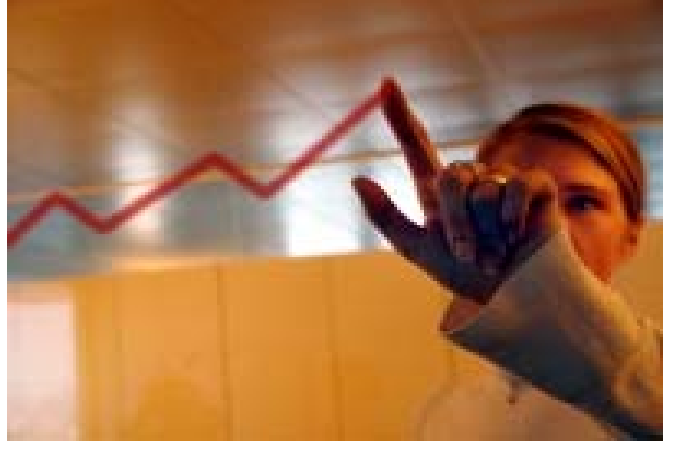
Keep track of key performance indicators at a glance.